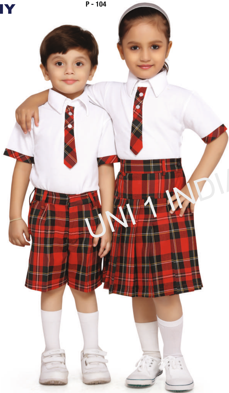
P - 104